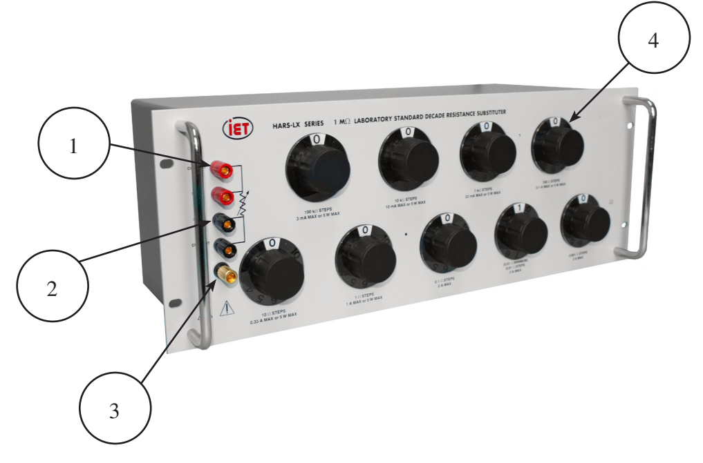
Figure 5-1: HARS-LX Replaceable Parts