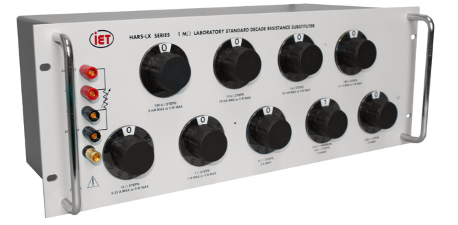
Figure 1-1: Sample HARS-LX unit

The HARS-LX series can start with a resolution as low as 1 m \Omega and go up over 12.2 M \Omega . It may be employed for exacting precision measurement applications requiring high accuracy and stability. The series can be used as components of dc and low frequency ac bridges, for calibration, as transfer standards, and as RTD simulators.